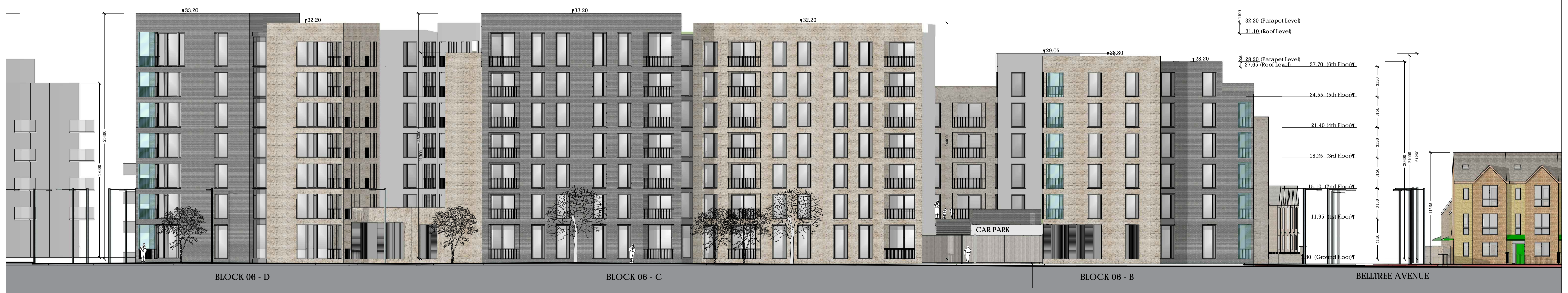
EAST ELEVATION Scale 1:200