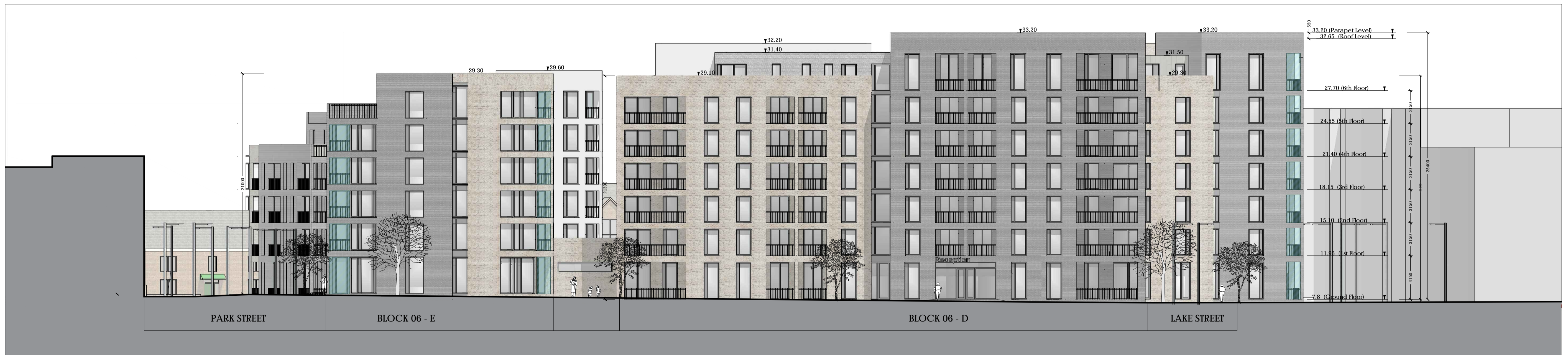
SOUTH ELEVATION Scale 1:200